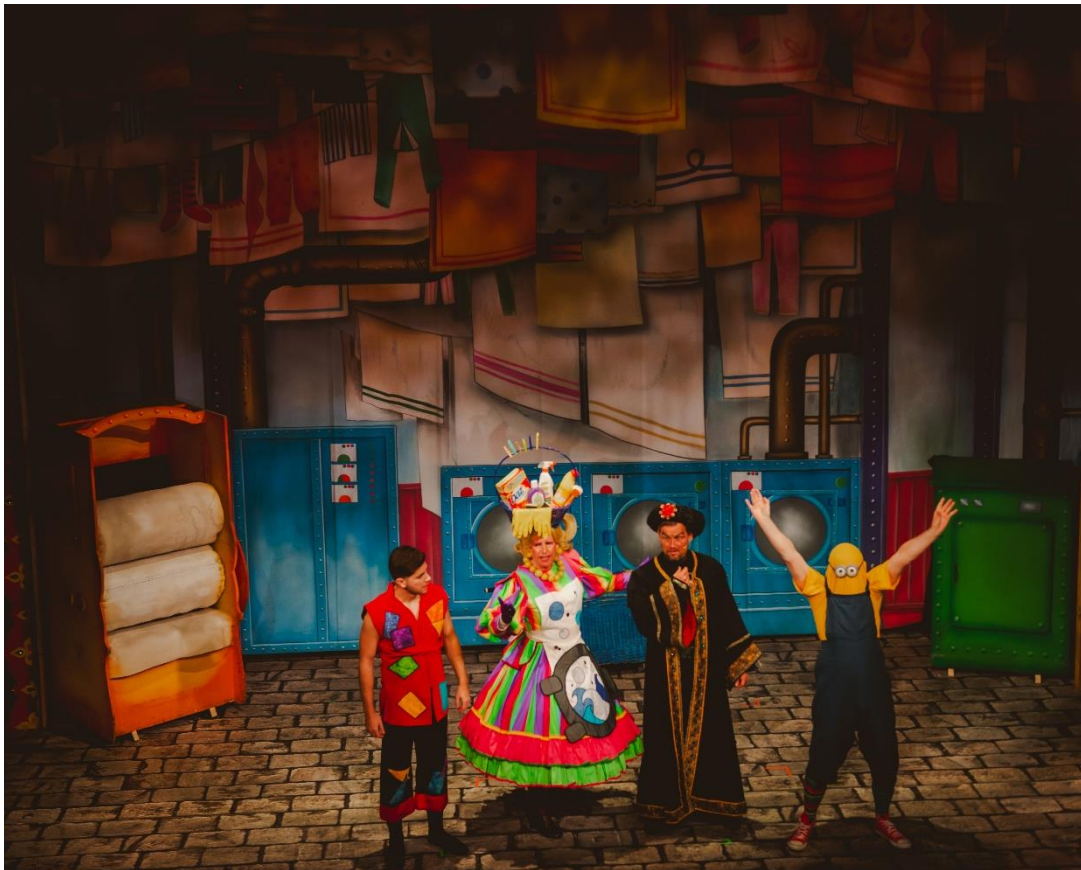
Figure 5: The Redditch Pantomime, Aladdin, at the Palace Theatre, 2025/26.

However, there are challenges on the horizon and the Committee will need to remain mindful of these and to maintain vigilance in reviewing the work of the company to ensure that services continue to best meet the needs of customers.