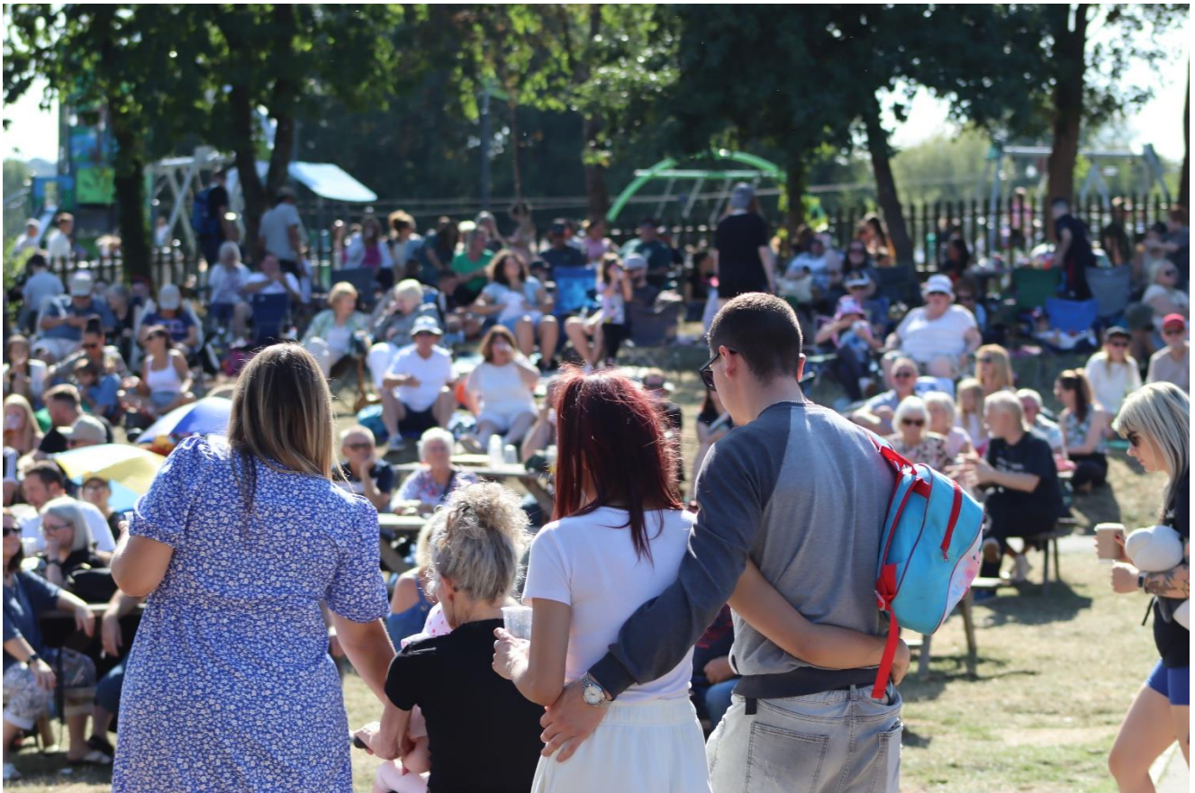
Figure 4: Sounds in the Grounds, Arrow Valley Visitor Centre, August 2025.

The last Annual Report from the Shareholders Committee was published at the start of the Local Government Reorganisation process and this has continued to progress in Worcestershire in 2025/26. There have been two submissions made to the Government in respect of Local Government Reorganisation. Whichever Unitary Authority model is introduced in Worcestershire, Rubicon Leisure Limited will not be the only Council company in the county to be impacted by these changes. Consideration will need to be given to the governance structure(s) for local authority companies that will be implemented as part of the move to Unitary Authority status.