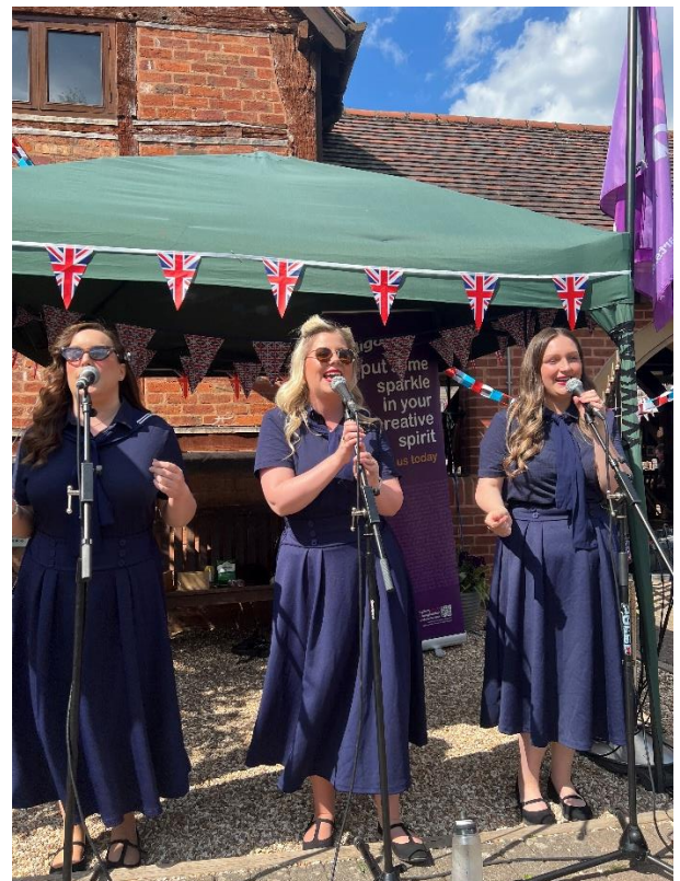
Figure 1: Forge Mill Needle Museum, 1940s Day (May 2025) – The Violettes