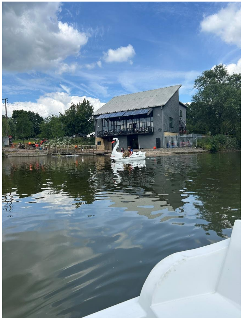
Figure 2: The Boathouse, Arrow Valley Visitor Centre

In addition, the Committee was pleased to note the positive contribution that venues and facilities provided by Rubicon Leisure Limited contributed to the health and wellbeing of residents living in the Borough. In particular, fitness and swimming opportunities at the Abbey Stadium were identified as making a positive contribution to the health and wellbeing of local residents.