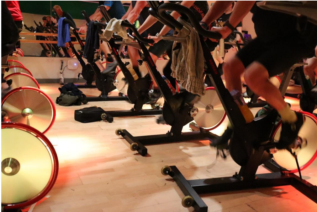
Figure 3: Fitness equipment in use at the Abbey Stadium

No recommendations were made by the Shareholders Committee to the Executive Committee in 2025/26.